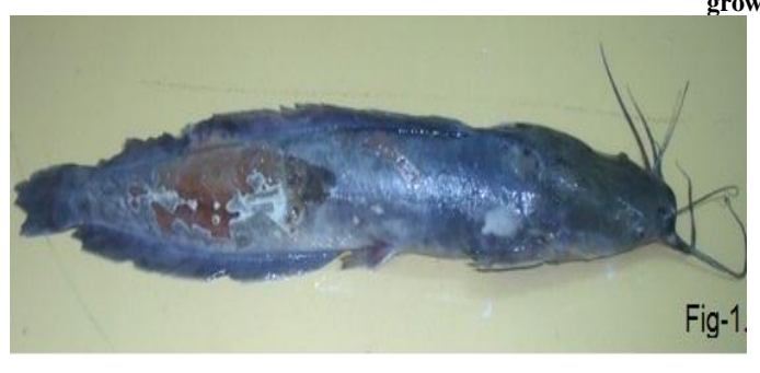
Fig 1 & 2. Showing Saprolegnia sp. infected C.gariepinus with lost epidermis and infected fins. Lesions on body surface with hyphal growth.

Data are the average \pm standard Error values of ten controls and fifteen infected estimated fishes. S= (P \leq 0.05).